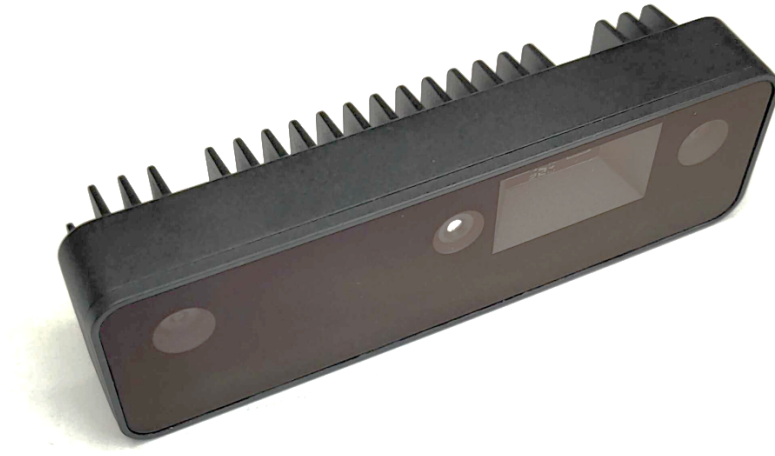
Figure 1 – OAK-D Pro