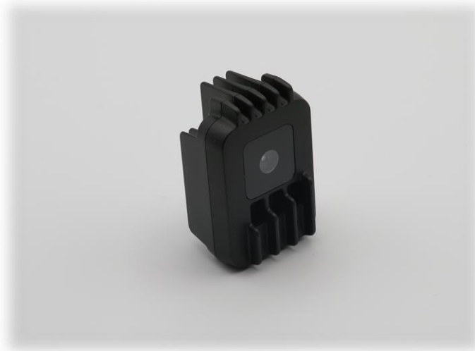
Figure 1 – OAK-1