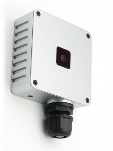
Figure 1 – OAK-1 PoE